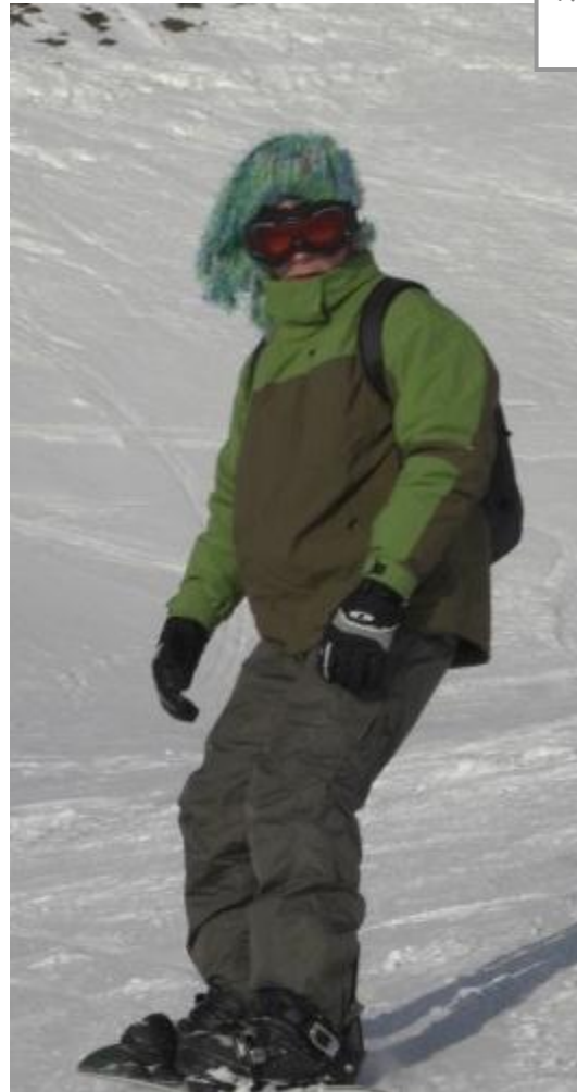
This was the original "dreadlock" hat